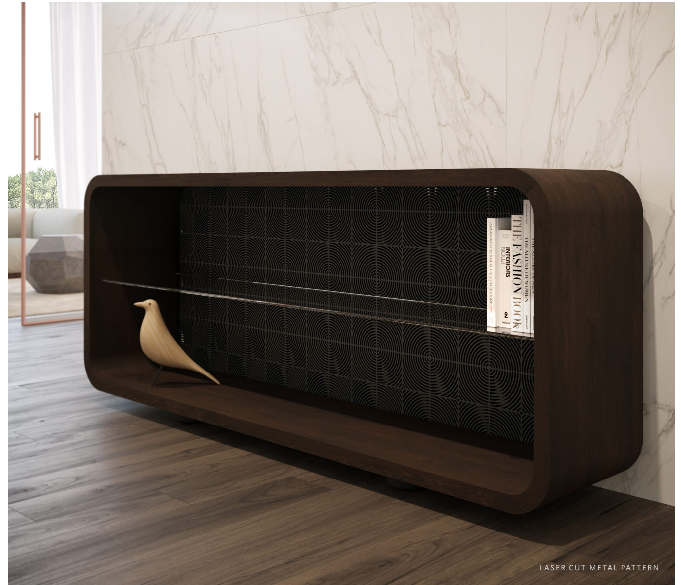
LASER CUT METAL PATTERN