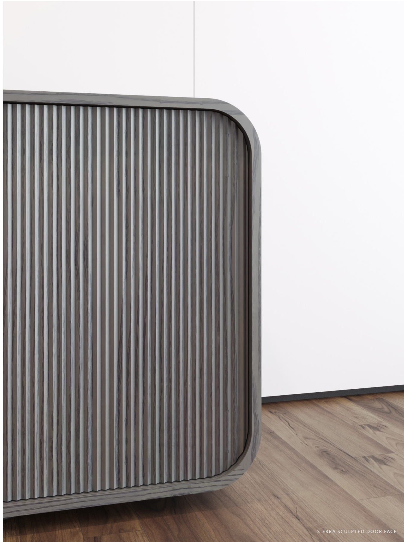
SIERRA SCULPTED DOOR FACE